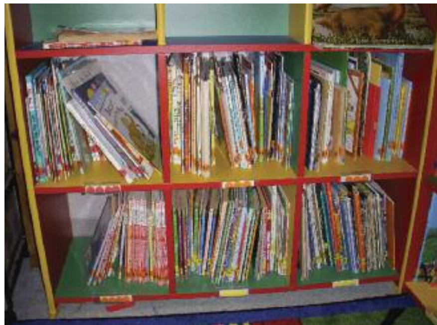
Figure 5. Books Color Coded by Reading Level

expectations of students shifted from a focus on student limitations to a focus upon learning expectations. She quickly discovered that previous decisions impacting planning, teaching, and even daily discussions about students were focused on students’ limitations and what students could not achieve. Therefore, instruction strategies often followed those low expectations and, as previously stated, “What teachers expect is typically what students do” (Quenemoen, 2003, p. 4). As the teacher implemented the practice of backward design, a shift in her mind